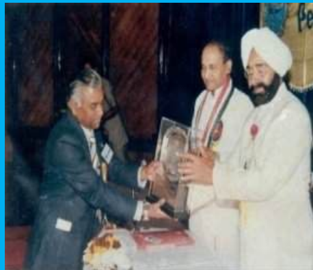
1994 Bharth Jyothi Award