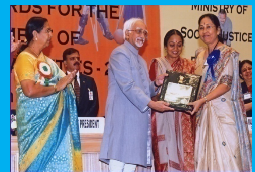
2008 Best Employer Award