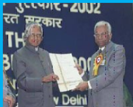
2002 Best Institution Award