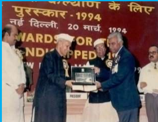
1994 Welfare Award

Recipient of National Awards from President of India