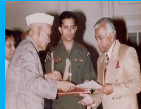
1995 Dr.B.C.Roy Award