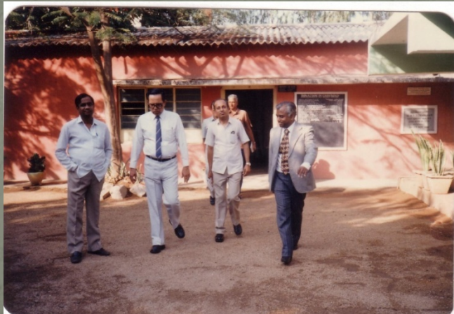
Moved from clinic to Temporary shed