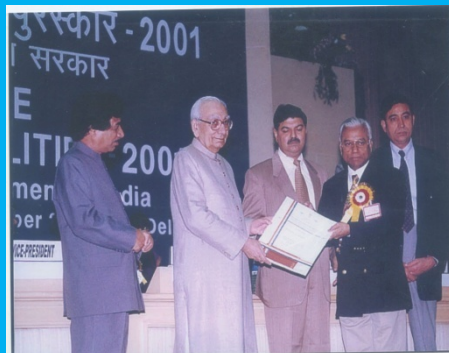
2001 Best Individual Award